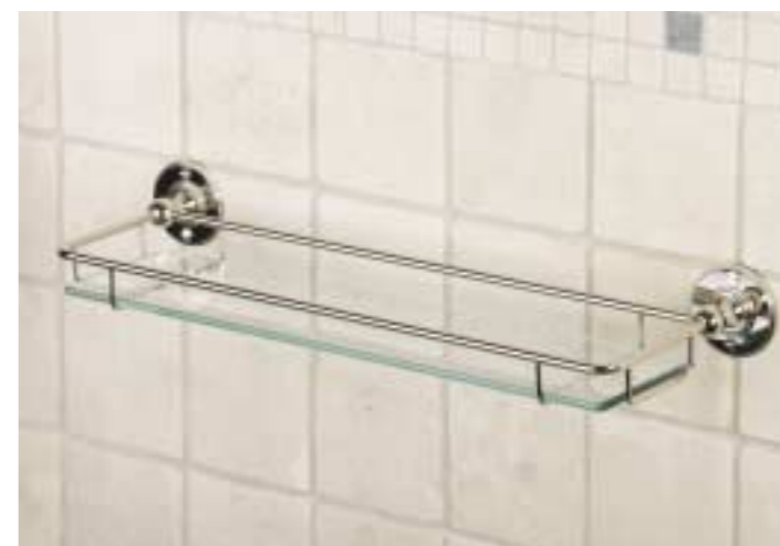
EMPIRE GALLERY SHELF