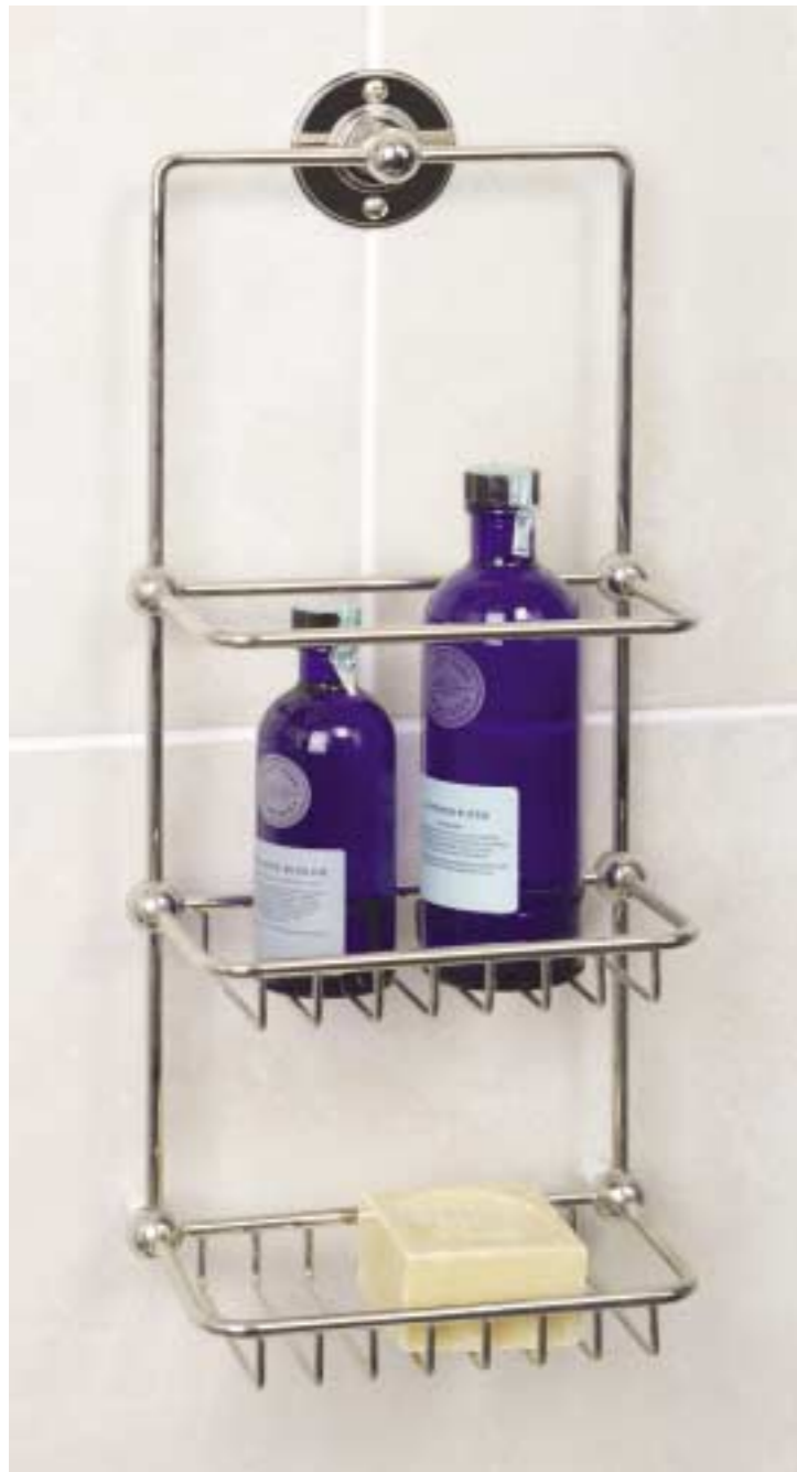
EMPIRE WIRE SHOWER TIDY