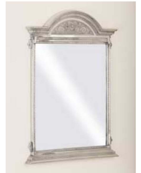
EMPIRE CAST METAL MIRROR POLISHED**