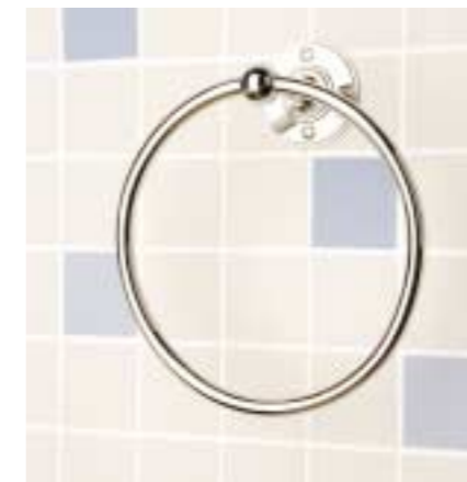
EMPIRE TOWEL RING