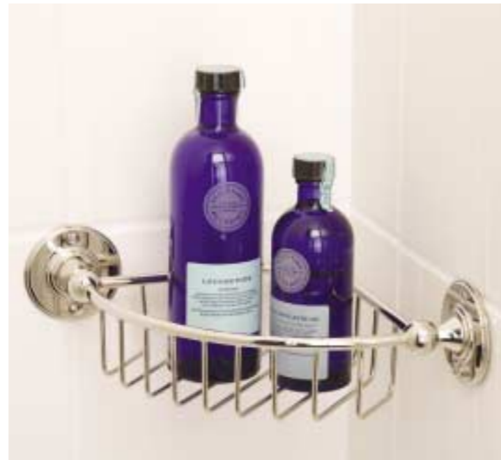
EMPIRE WIRE CORNER BASKET