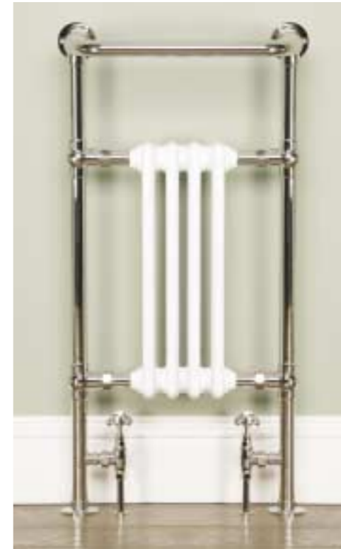
CLOAKROOM HEATED TOWEL RADIATOR