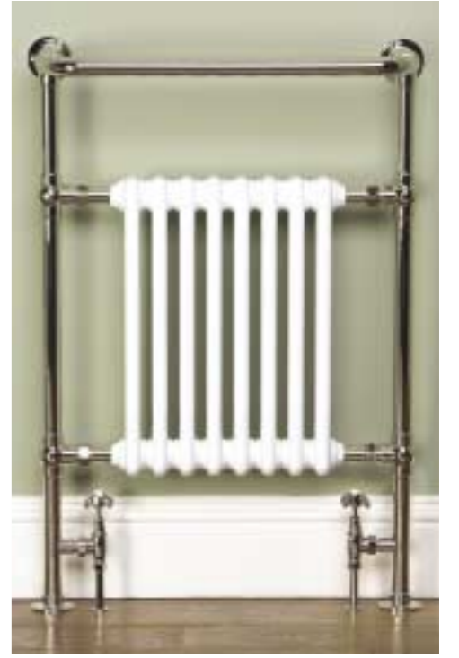
HEATED TOWEL RADIATOR WITH VALVES