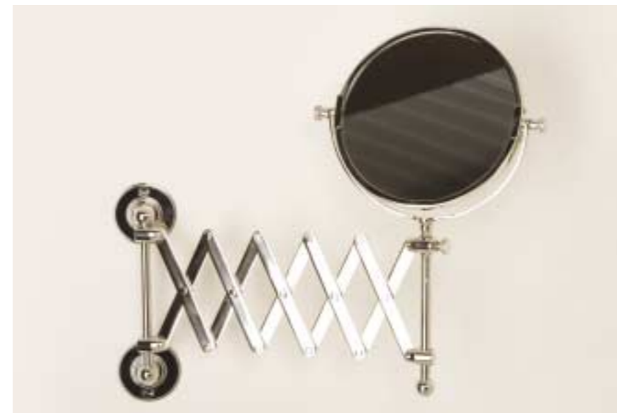
EMPIRE EXTENDABLE SHAVING MIRROR