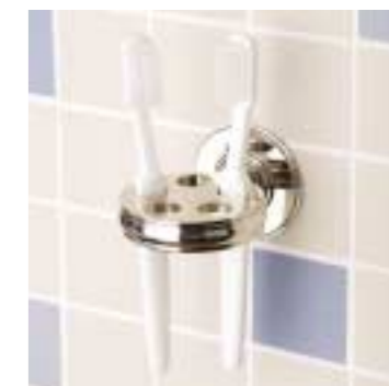
EMPIRE TOOTHBRUSH HOLDER