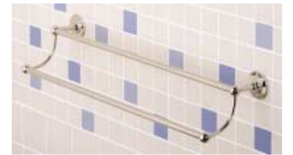
EMPIRE TOWEL RAIL*