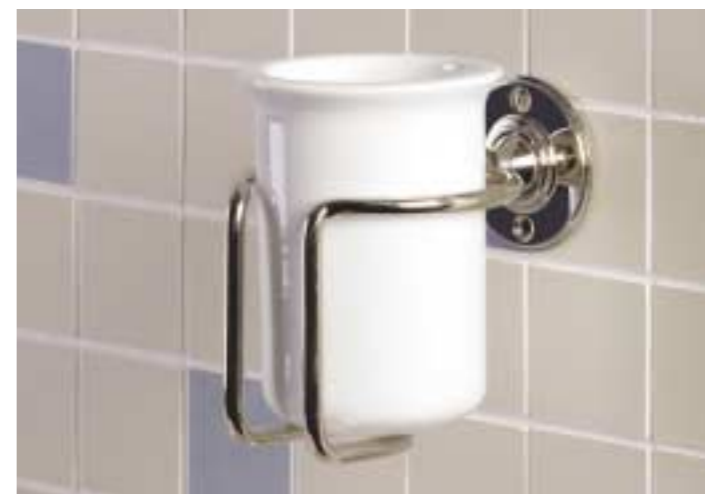
EMPIRE CHINA CUP & HOLDER