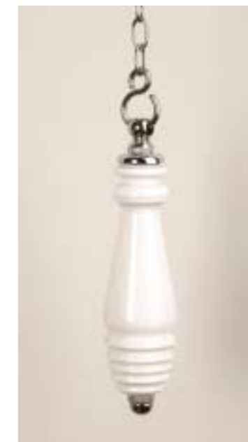
EMPIRE CERAMIC CHAIN PULL