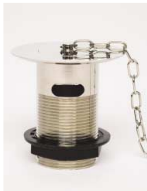
BUTLER SINK WASTE, PLUG & CHAIN

All our fittings are made from solid brass and to British Standard sizes.