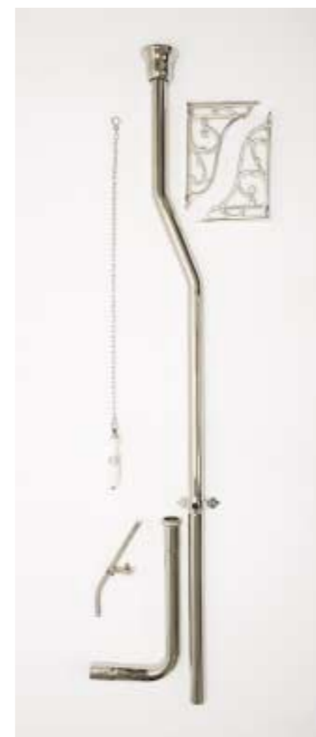
HIGH LEVEL FLUSH PIPE ASSEMBLY