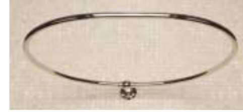
ROUND WALL MOUNTED SHOWER RAIL