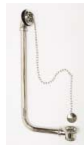
EXPOSED BATH WASTE & OVERFLOW