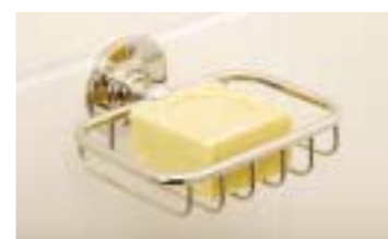
EMPIRE WIRE SOAP BASKET