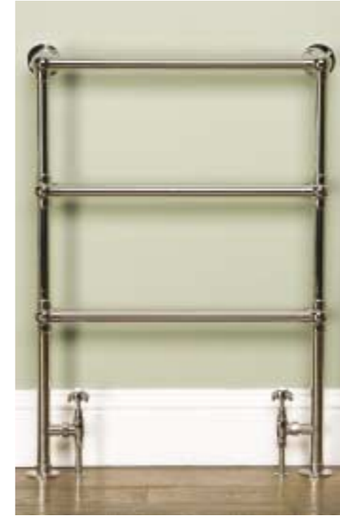
HEATED TOWEL RAIL WITH VALVES