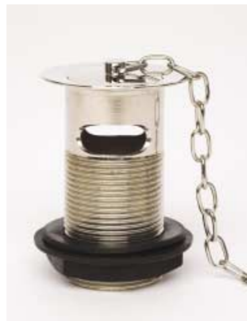
BASIN WASTE, PLUG & CHAIN