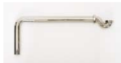
EXPOSED BATH TRAP & OUTLET PIPE