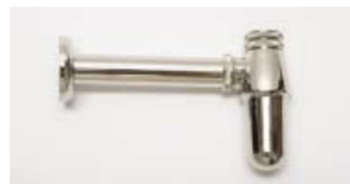
BASIN BOTTLE TRAP