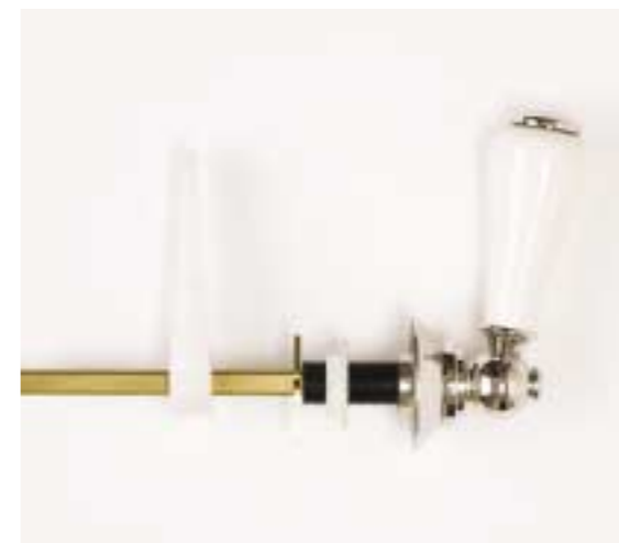
LOW LEVEL CERAMIC CISTERN LEVER