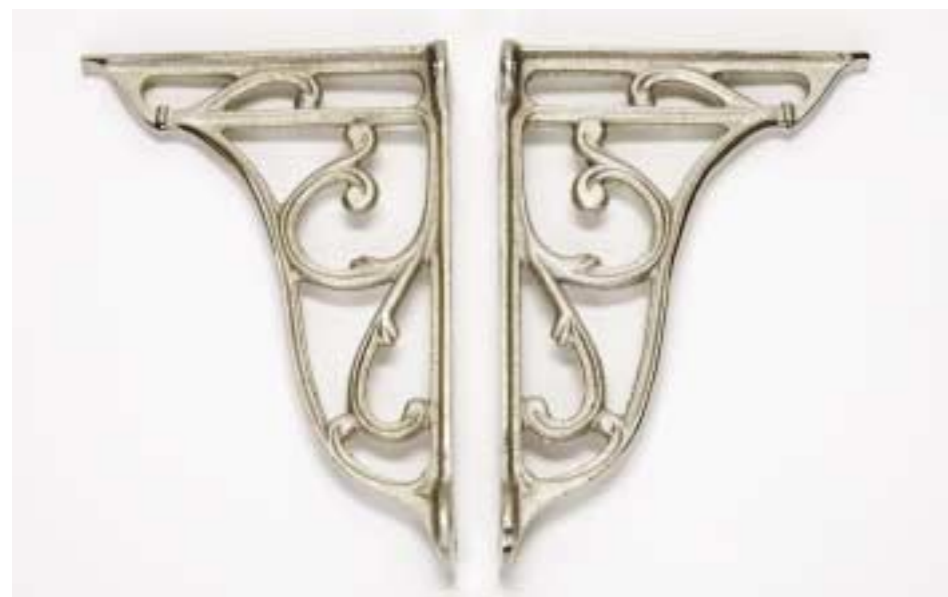
ORNATE BASIN / CISTERN BARCKETS