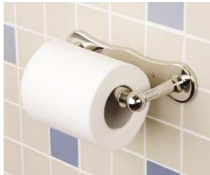
EMPIRE PAPER HOLDER