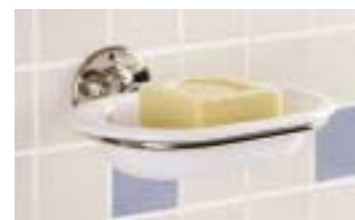
EMPIRE CHINA SOAP DISH