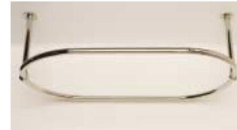
OVAL CEILING MOUNTED SHOWER RAIL

These traditional tubular shower rails and towel radiators are made from solid brass. Standard sizes shown, but these can be made to your own specification.