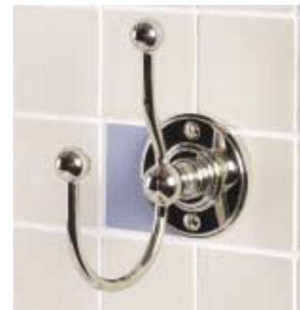
EMPIRE ROBE HOOK*