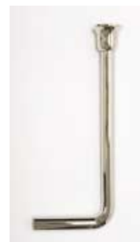
LOW LEVEL FLUSH PIPE