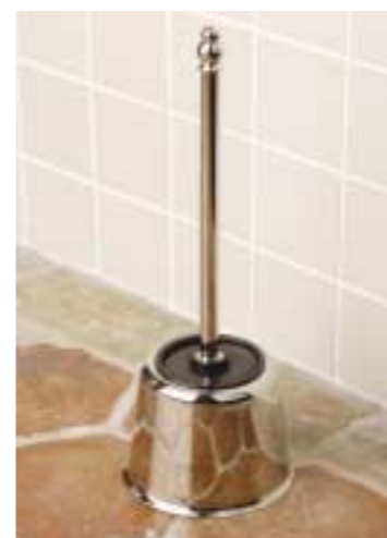
EMPIRE TOILET BRUSH & HOLDER